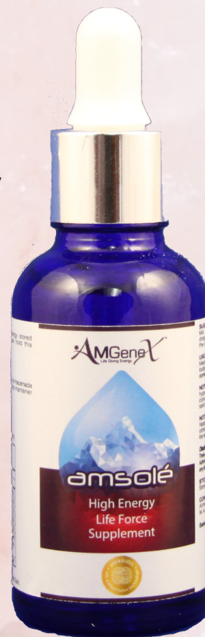
Size: 30 ml / 1.01 oz 30 day supply in glass bottle with dropper